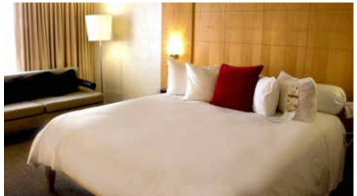
The superb comforts of a Club Room