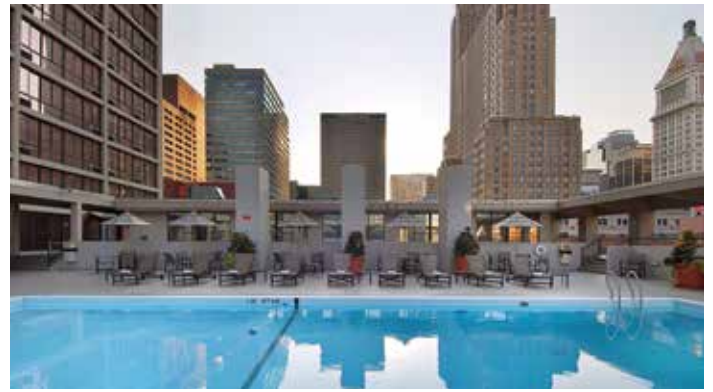
Downtown's only rooftop pool