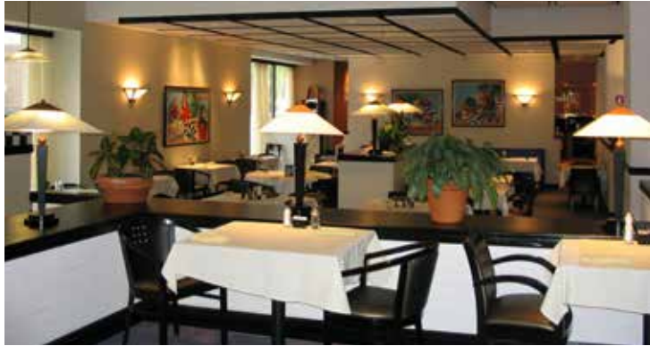
American favorites at Bistro on Elm